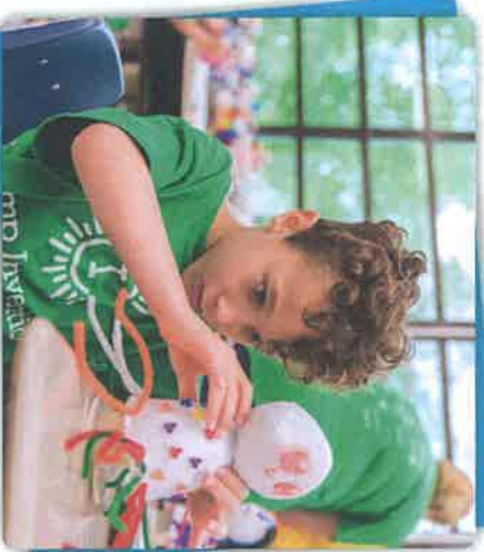
A first grader uses creative problem solving to turn a robot into a stuffer with style.