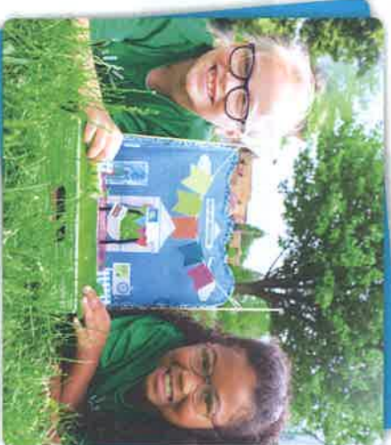
Third graders build collaboration skills as they create their very own pop-up business.