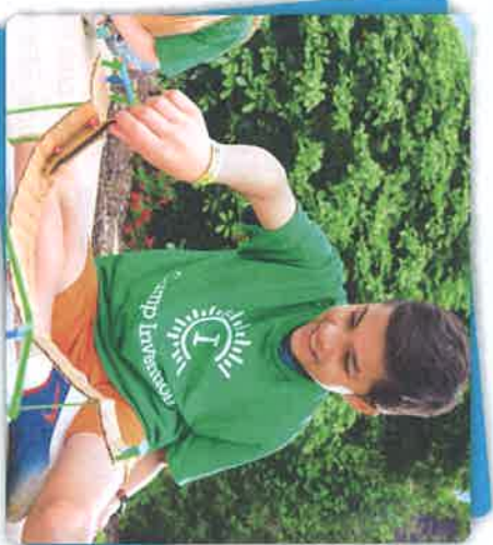
A fifth grader practices tricks — and persistence — with the mini skate park they designed.